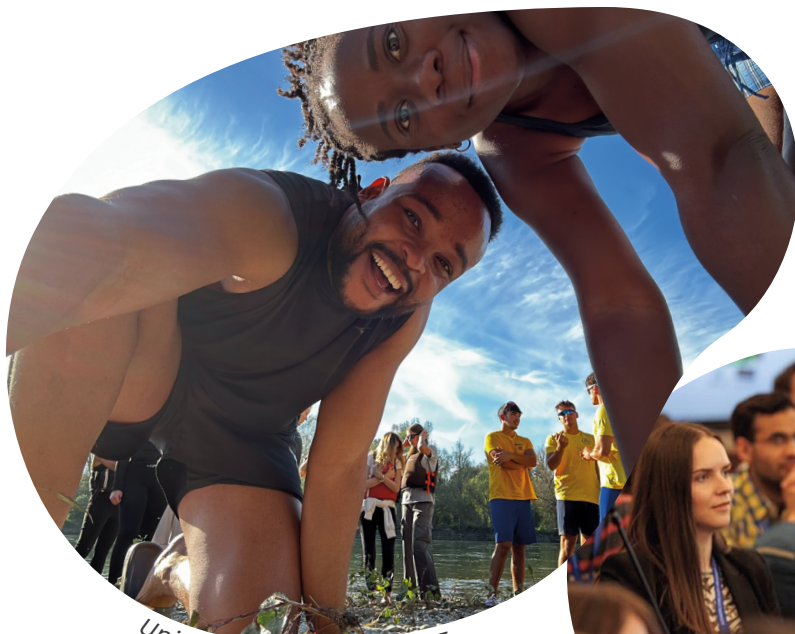
University of Pavia - 2025

The Alliance successfully organised two editions of the EC2U Student Event: in Iași (2024) and Pavia (2025). Open to all students from EC2U universities, these events are designed to reinforce the vision of an integrated European campus and promote active citizenship . Over 150 students participated, with feedback revealing a significant impact.