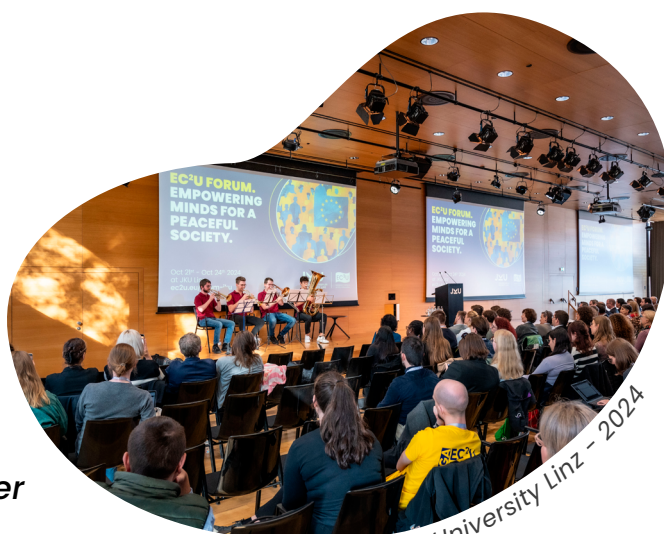
Johannes Kepler University Linz - 2024