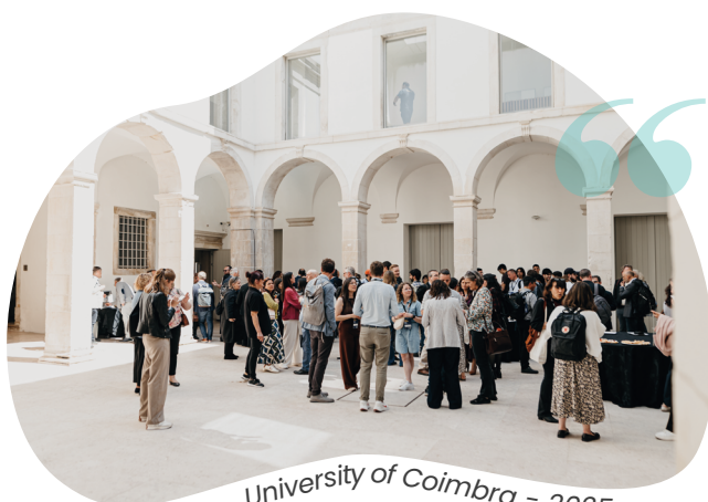
University of Coimbra - 2025

I have the feeling that we are able to contribute to building a unique European spirit or identity on the basis of European alliances, and EC2U in particular.