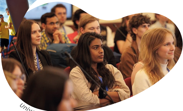
University of Iași - 2024

“ In terms of personal development, it's been a good opportunity to gain soft skills and to see how I have applied the ones I already have. ” A student participant