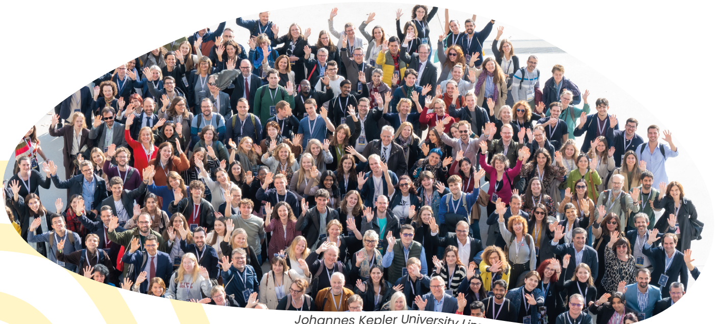
Johannes Kepler University Linz – 2024

Equal participation is the foundation of the Alliance: each university plays the same role in governance and management, and contributes equally to the realisation of its missions to strengthen a collective impact .