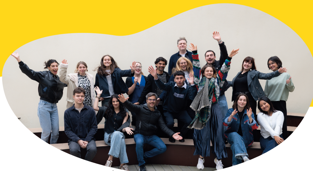
University of Poitiers - 2025