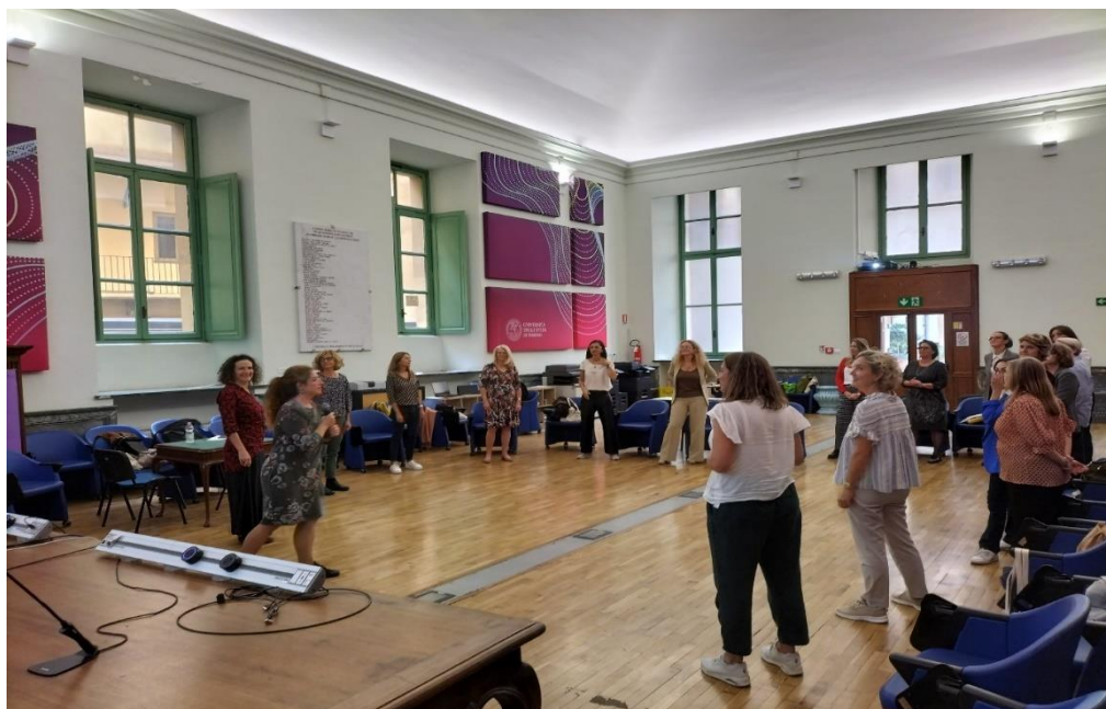
Figure 1: Train the trainers event in Torino