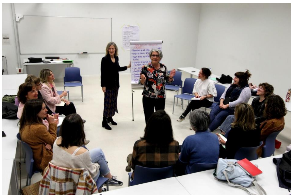
Figure 1. Akademe Programme (University of the Basque Country – ENLIGHT Alliance)

https://www.ehu.eus/documents/2007376/43960833/EHU-Equality-in-figures-2022.pdf/20a4c613-ba40-c8d0-7d72-3183e7f9f9d3?t=1683201166714